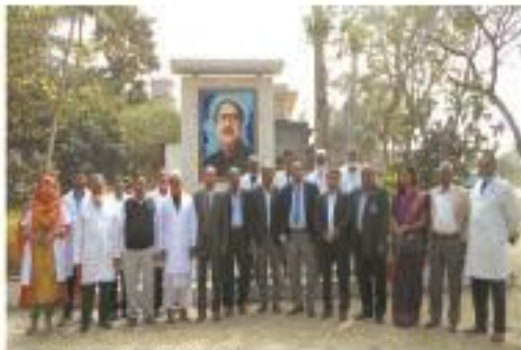
▶ Visit of BMDC, 2020