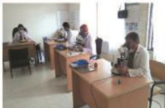
▶ Hospital Pathology