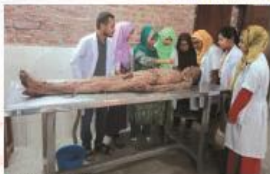
▶ Dissection Hall