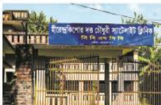
▶ Satellite Clinic of CBMGB at Rouha, Netrokona