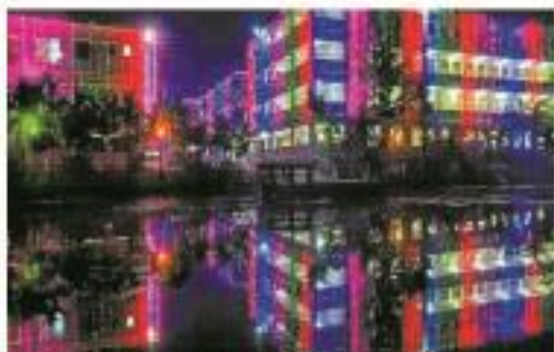
▶ New look of CBMCB during Silver Jubilee programme