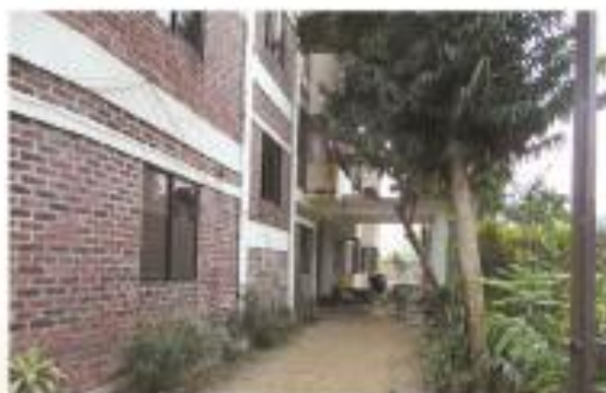
▶ Girls' Hostel