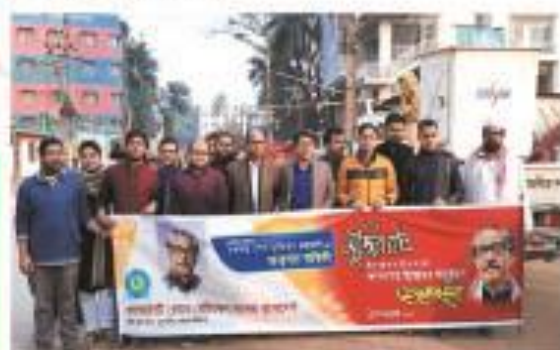
▶ Countdown of "Mujib Borsho"