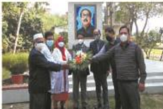
▶ Visit of Director, Health, Mymensingh Division