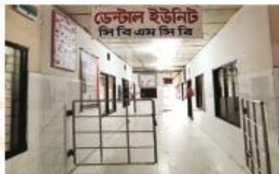
▶ Dental Unit