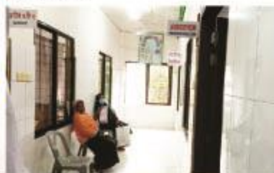
▶ OPD : Dental Unit