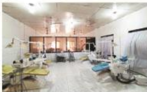
▶ Dental OT