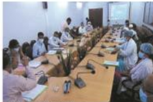
▶ Visit of DGHS, 2020