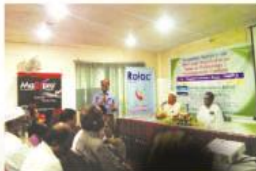
▶ Scientific Presentation : Dental Unit