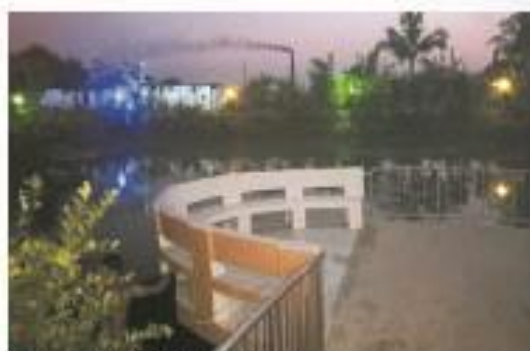
▶ Pond side Baikali Ghat