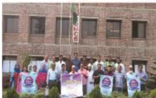
▶ Launching Programme