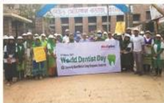
▶ World Dentistry Day