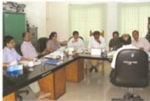
▶ GB Meeting