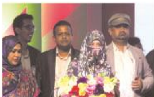
▶ Reminiscence (Student)