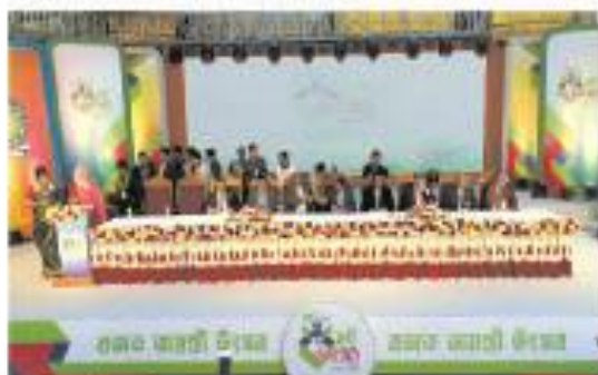
▶ Opening Ceremony