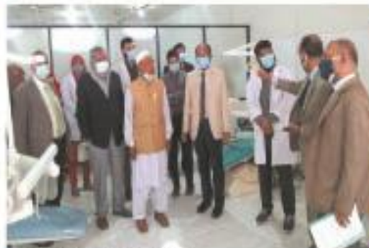
▶ BMDC Visit Dental Unit