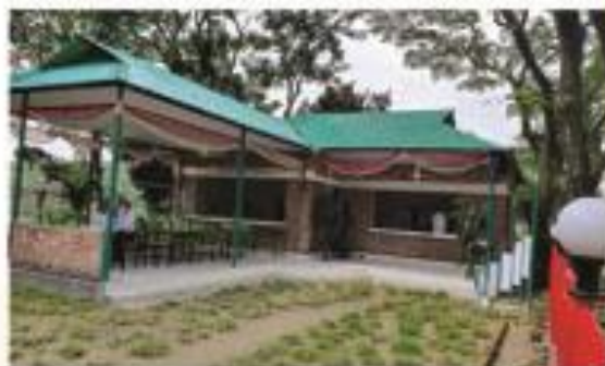
▶ Canteen at Hostel Compound