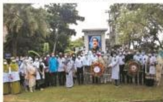
▶ 15 August, National Mourning Day, 2020