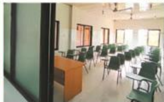
▶ Class Room