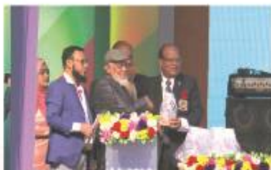
▶ Reminiscence (Teacher)