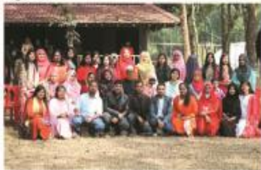
▶ Picnic at Aranya Eco Resort, Valuka