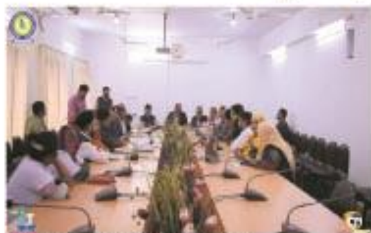
▶ Preparatory meeting of Silver Jubilee