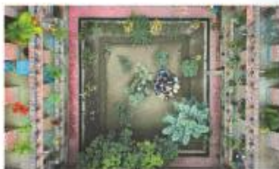
▶ Greenery inside the College