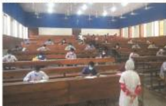
▶ Exam during Corona maintaining proper hygiene and social distancing