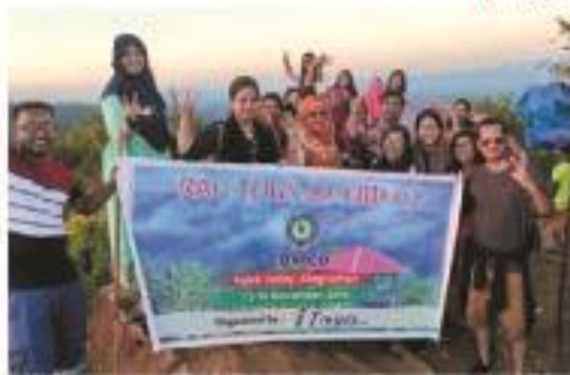
▶ RAG Tour of CBD-02 in Sajek Valley, Khagrachari, 2019