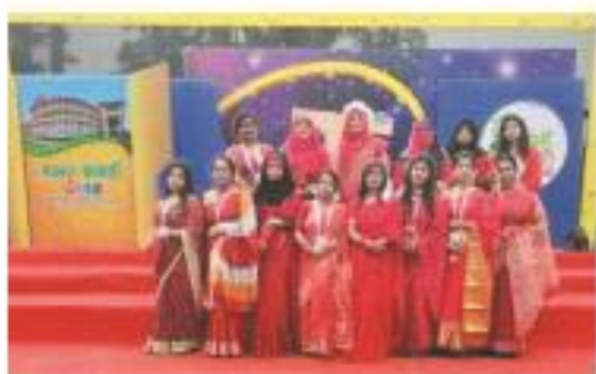
▶ Dental Students Enjoying Silver Jubilee