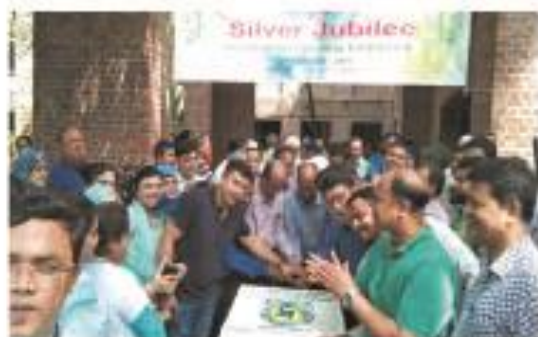
▶ Registration Opening Ceremony