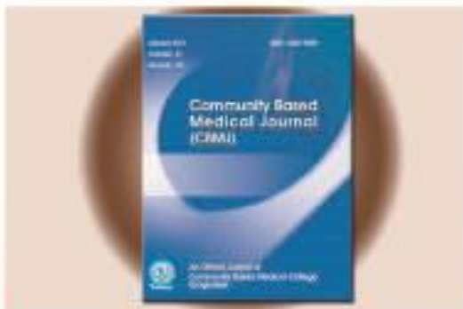
▶ CBMCB Journal