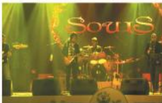
▶ Cultural programme (Souls-Partho Borua)