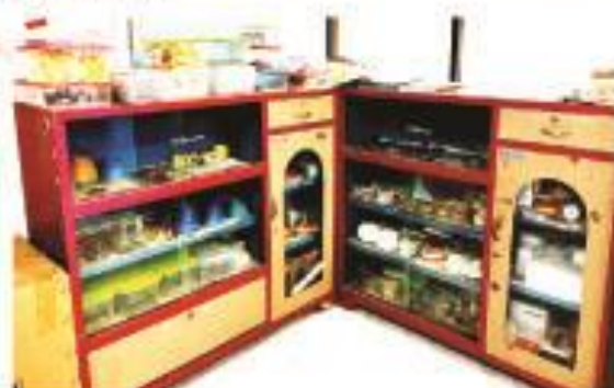
▶ Dental Lab