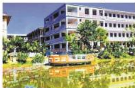
▶ Hospital Extension Building