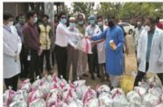
▶ Food assistance programme near by villages by the teachers & employees of CBMCS during Corona period