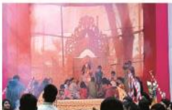
▶ Saraswati Puja, 2020