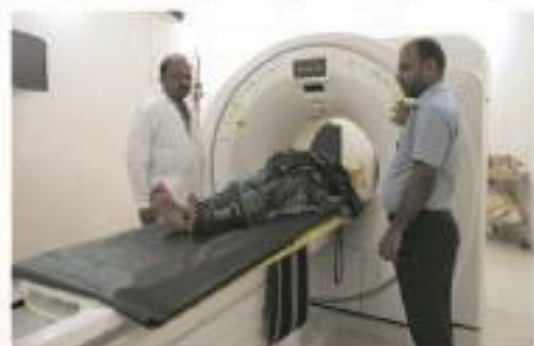
▶ CT Scan