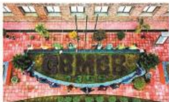
▶ College entry (Old)