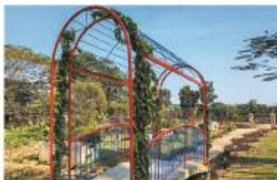
▶ Garden at Hostel Compound