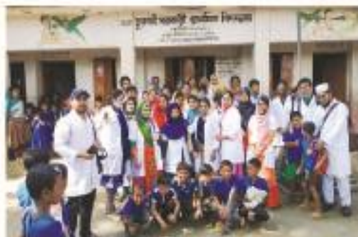
▶ Field Training of DPH