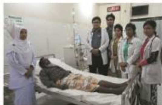
▶ Department of Nephrology (Haemodialysis Unit)