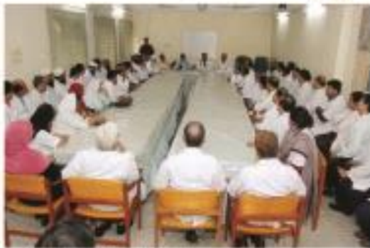
▶ Academic Council Meeting