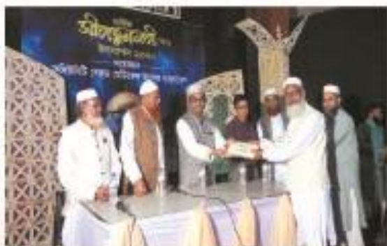
▶ Annual Milad-Mahfil, 2020