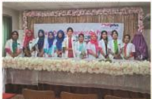
▶ 2nd Batch BDS Intern Reception Program