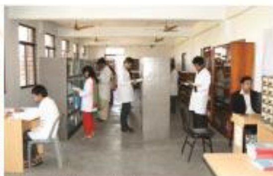
▶ Internet & Library Work