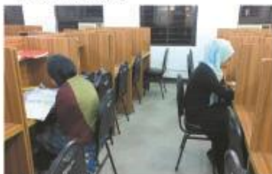
▶ Reading Room