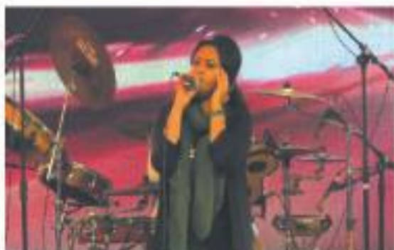
▶ Cultural programme (Sumi-Chirkut)