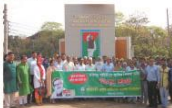
▶ 17th March 2020, Birthday of Father of Nation Bangabandhu Sheikh Mujibur Rahman & National Children Day