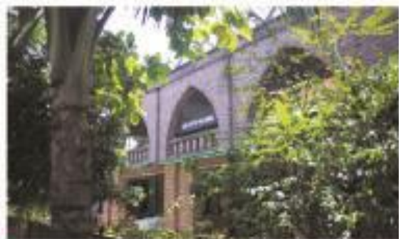
▶ College Mosque