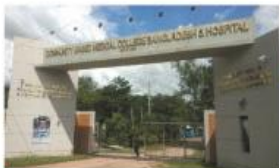
▶ Main Gate (New)