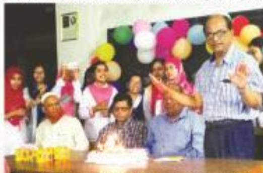
▶ Principal Talking in Celebration of Dental Unit good Result in 1st Prof. BDS Exam.