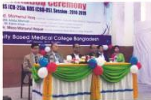
▶ Orientation Ceremony of CB-25 & CBD-05