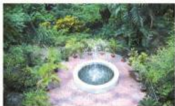
▶ Showering beauty