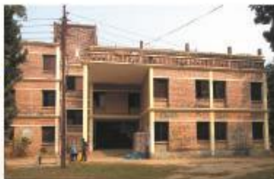
▶ Boys' Hostel