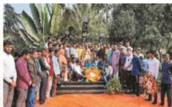
▶ International Mother Language Day, 2020