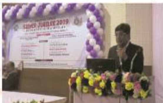
▶ Scientific Seminar