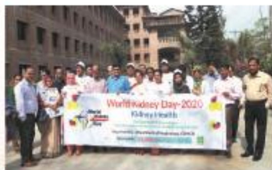
▶ World Kidney Day, 2020