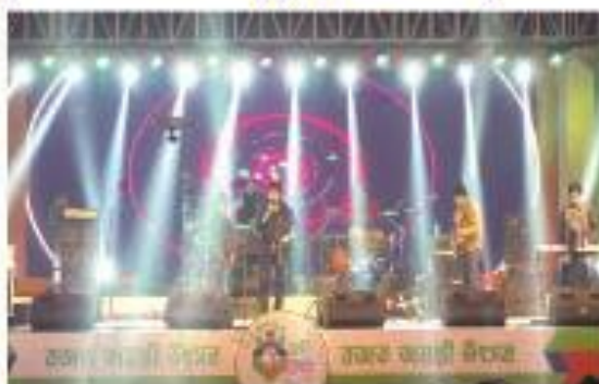
▶ Cultural programme (Kumar Biswajit)