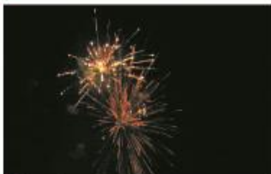
▶ Fire works