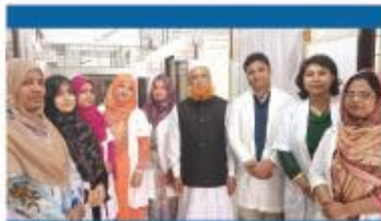
▶ Faculty Members, Dental Unit