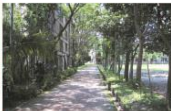
▶ Way to Hostel