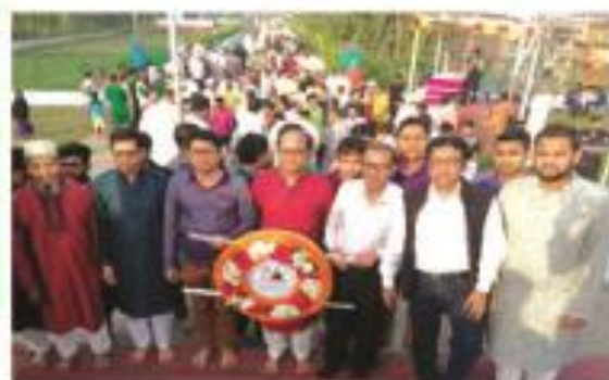
▶ National Independence Day, 2019