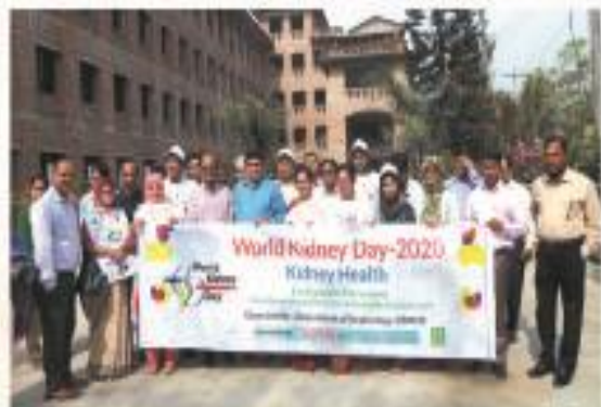
▶ World Kidney Day, 2020