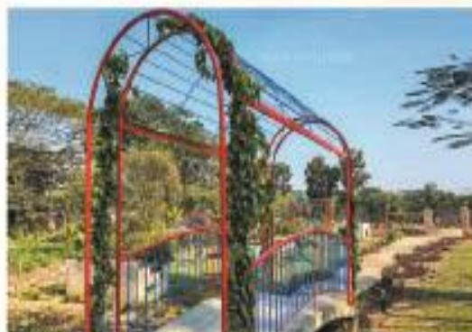
▶ Garden at Hostel Compound