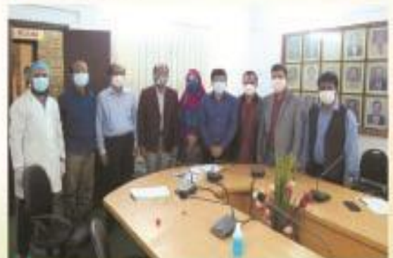
▶ Teachers Representative Election of CBMCB, 2020