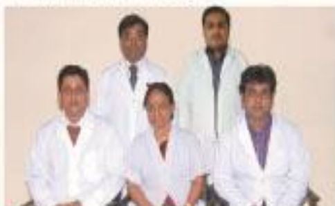
▶ Department of Anaesthesiology