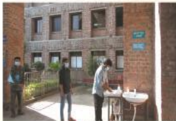
▶ Exam during Corona maintaining proper hygiene and social distancing