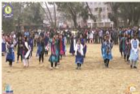
▶ Flash mob