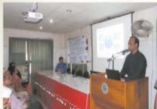
▶ Weekly Clinical Meeting