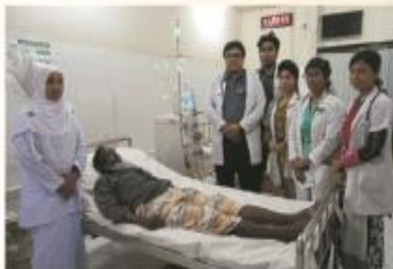
▶ Department of Nephrology (Haemodialysis Unit)