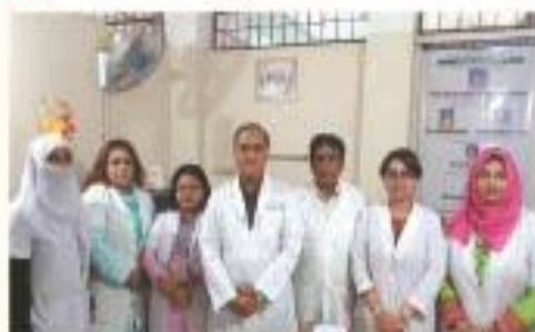
▶ Department of Dermatology & VD