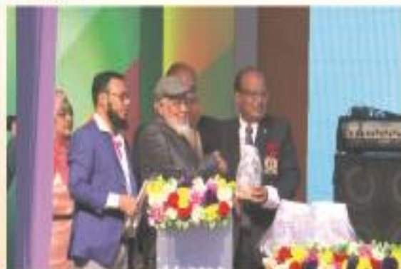
▶ Reminiscence (Teacher)