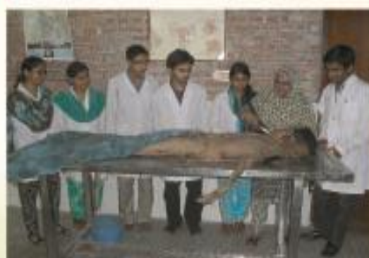
▶ Dissection Hall