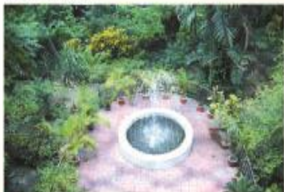
▶ Showering beauty