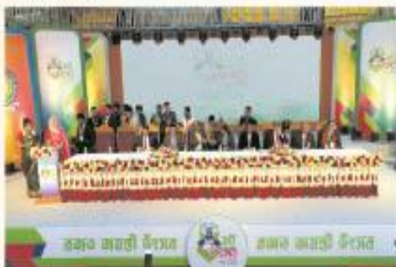
▶ Opening Ceremony