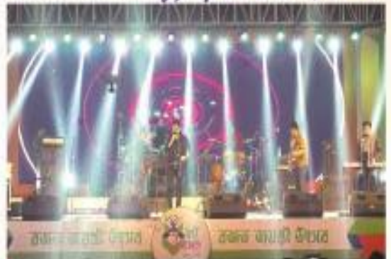
▶ Cultural programme (Kumar Bishwajit)