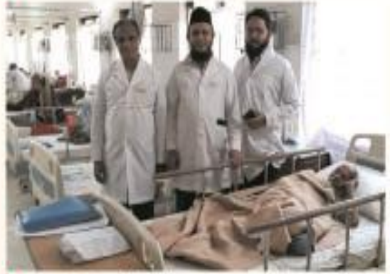
▶ Department of Cardiology