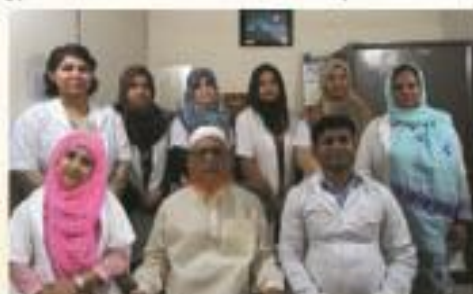
▶ Dental Unit