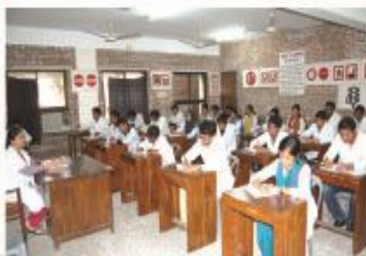
▶ Tutorial Class