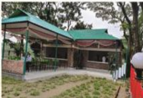
▶ Canteen at Hostel Compound