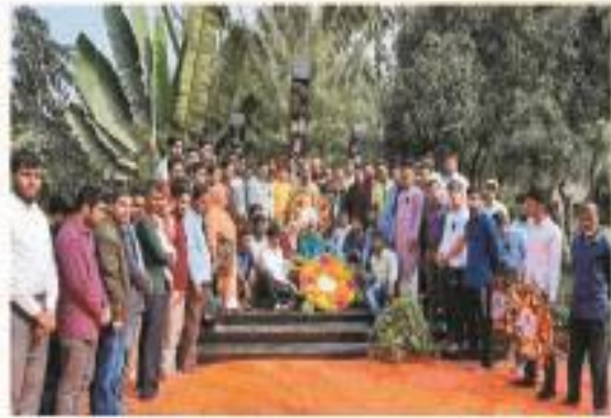
▶ International Mother Language Day, 2020