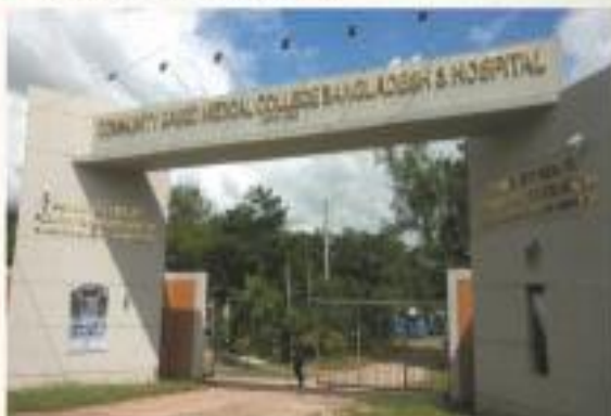
▶ Main Gate (New)