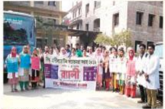
▶ World Antibiotic Awareness Day, 2019