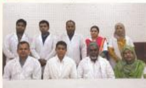
▶ Department of Head neck Surgery & Ophthalmology