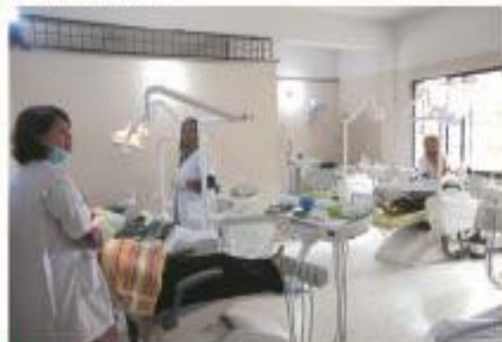
▶ Dental Unit