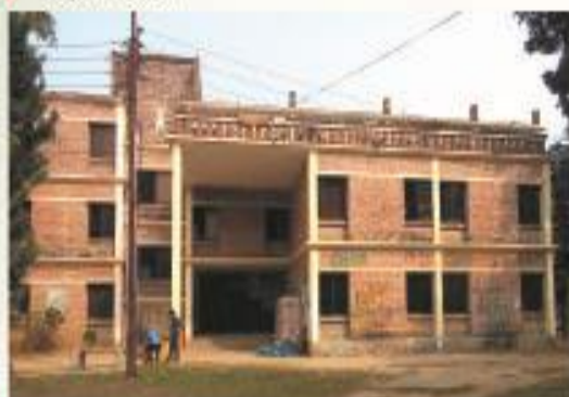
▶ Boys' Hostel