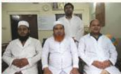
▶ Department of Ortho-Surgery