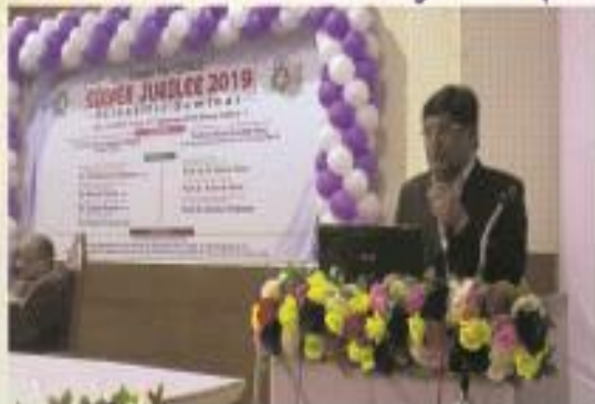
▶ Scientific Seminar