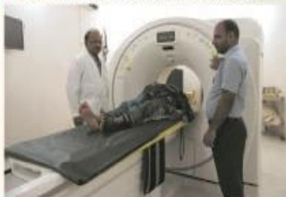
▶ CT Scan