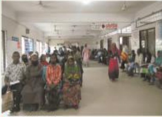
▶ OPD Waiting Place