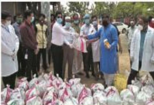
▶ Food assistance programme near by villages by the teachers & employees of CBMCB during Corona period