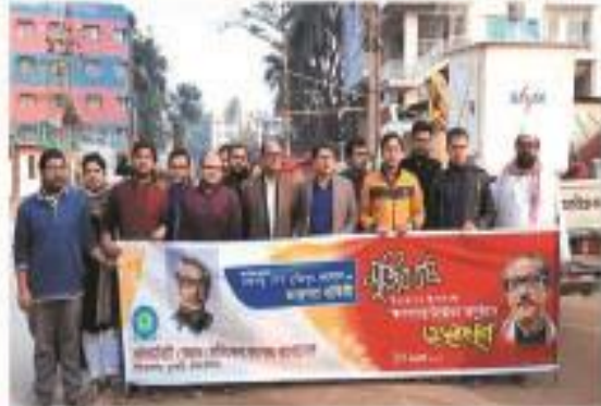
▶ Countdown of "Mujib Borsho"