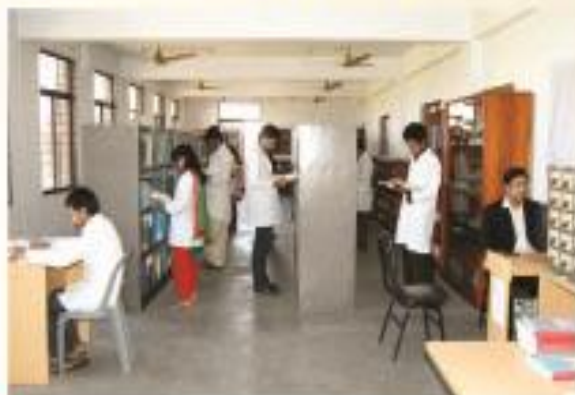
▶ Internet & Library Work