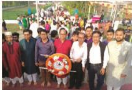
▶ National Independence Day, 2019