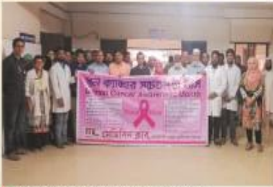
▶ Breast Cancer Awareness month, 2019