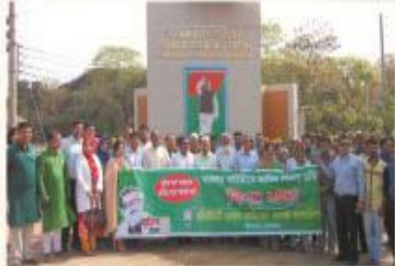
▶ 17th March 2020, Birthday of Father of Nation Bangabandhu Sheikh Mujibur Rahman & National Children Day