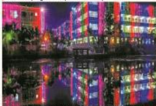
▶ New look of CBMCB during Silver Jubilee programme