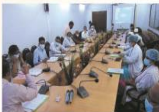
▶ Visit of DGHS on 25 August, 2020