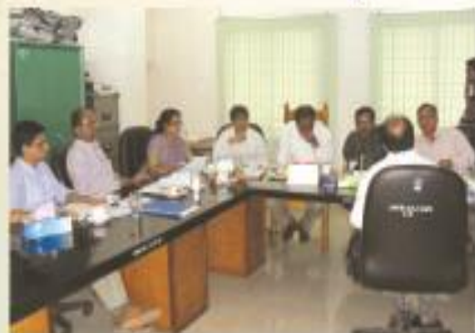
▶ GB Meeting