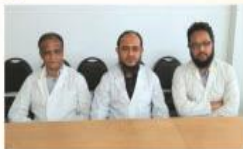
▶ Department of Cardiology