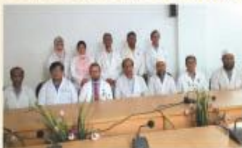
▶ Department of Medicine, Nephrology & Psychiatry