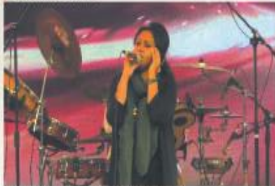
▶ Cultural programme (Sumi-Chirkut)