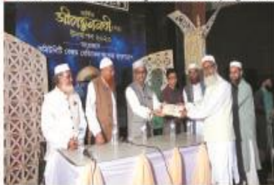
▶ Annual Milad-Mahfil, 2020