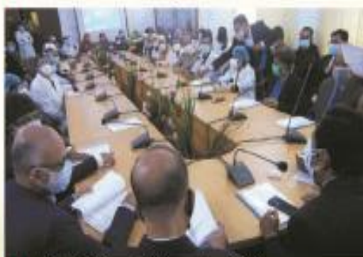
▶ Visit of DGHS on 12 December, 2020