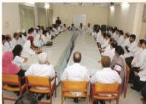
▶ Academic Council Meeting