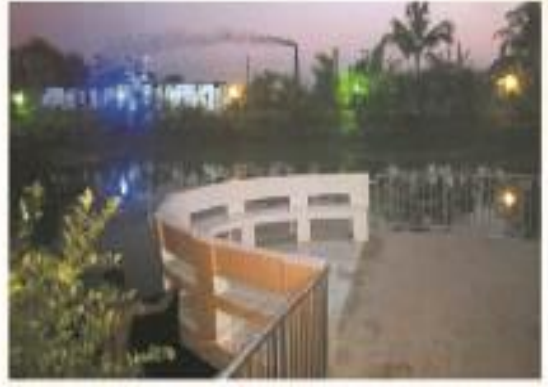
▶ Pond side Baikali Ghat