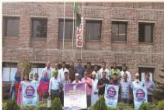
▶ Launching Programme