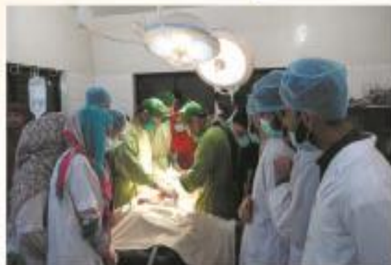
▶ Operation Theatre