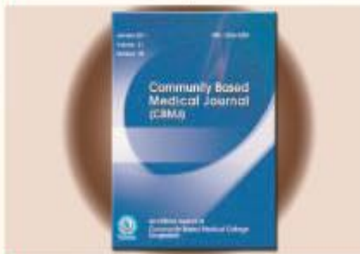
▶ CBMCB Journal