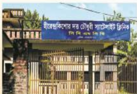
▶ Satellite Clinic of CBMCB at Rouha, Netrokona