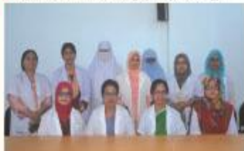
▶ Department of Obstetrics & Gynaecology