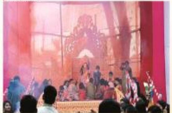
▶ Saraswati Puja, 2020