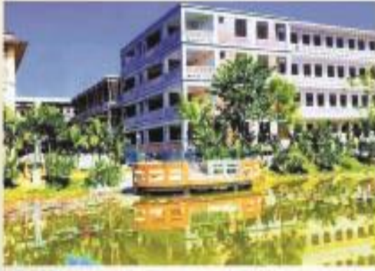
▶ Hospital Extension Building