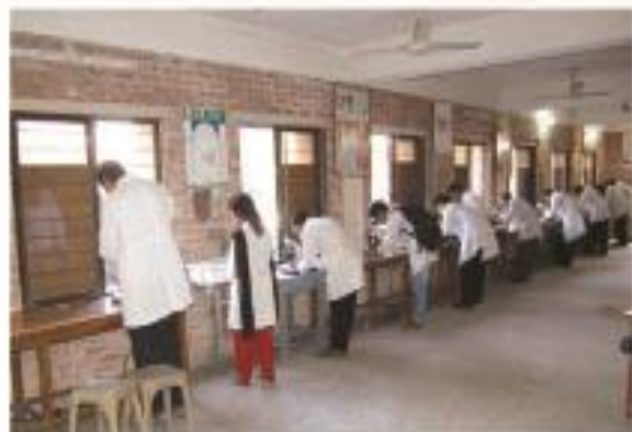
▶ Laboratory Work