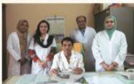
▶ Department of Forensic Medicine