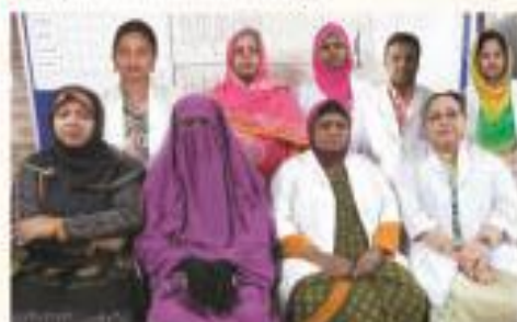
▶ Department of Pharmacology