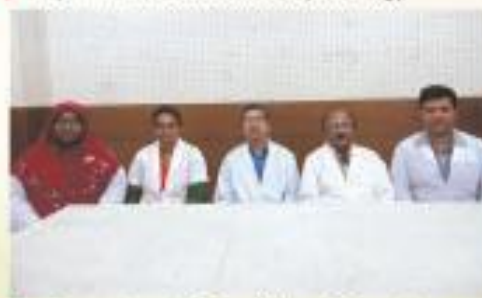
▶ Department of Radiology & Imaging