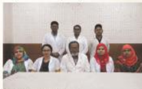
▶ Department of Pathology