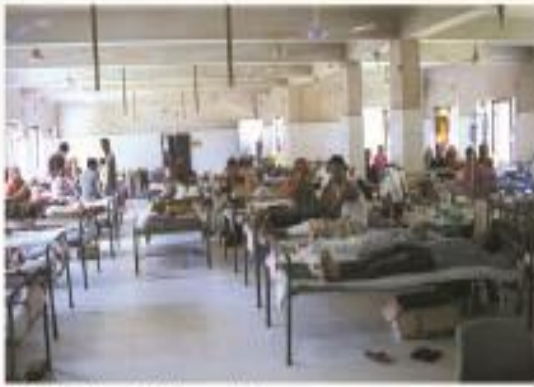
▶ Male Ward (Orthopedic)