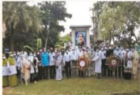
▶ 15 August, National Mourning Day, 2020