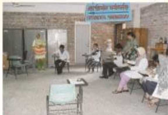
▶ Practical Class