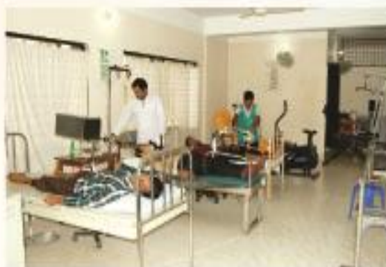
▶ Physiotherapy Unit