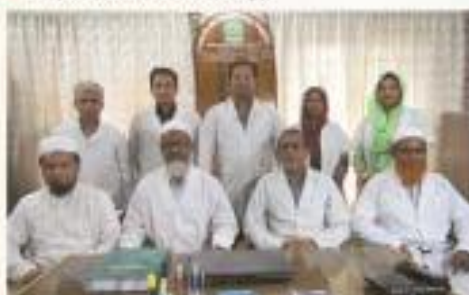
▶ Department of Community Medicine