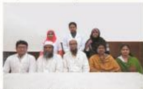
▶ Department of Biochemistry