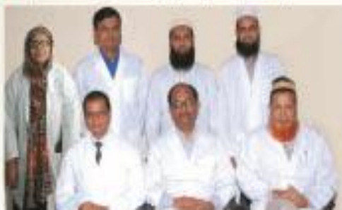
▶ Department of Paediatrics