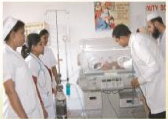
▶ Neonatal Ward