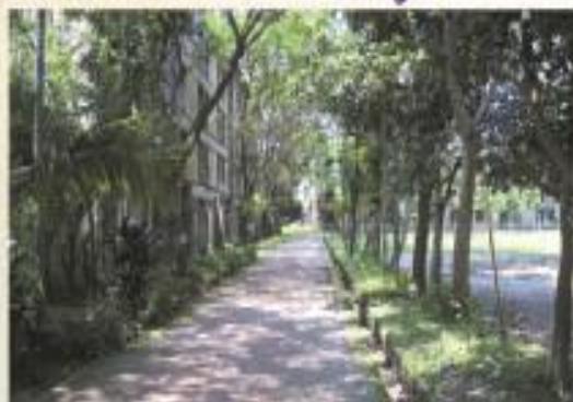
▶ Way to Hostel