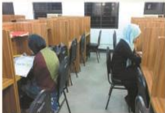
▶ Reading Room