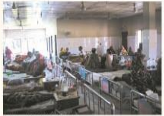
▶ Female Ward (Medicine)