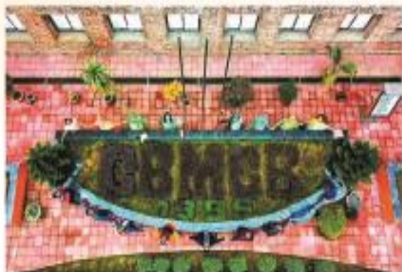
▶ College entry (Old)