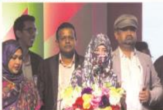
▶ Reminiscence (Student)