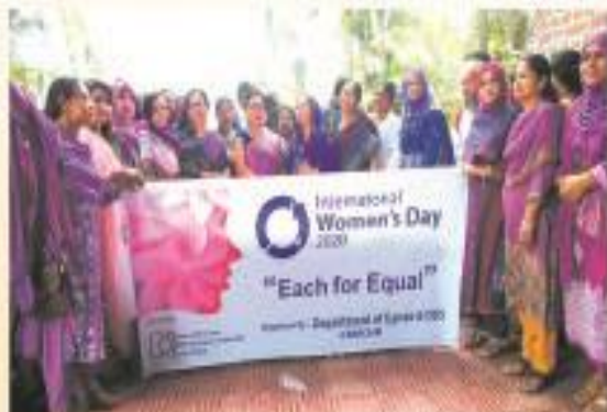
▶ International Women's Day, 2020