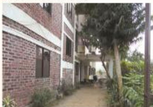
▶ Girls' Hostel