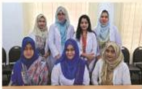
▶ Department of Physiology