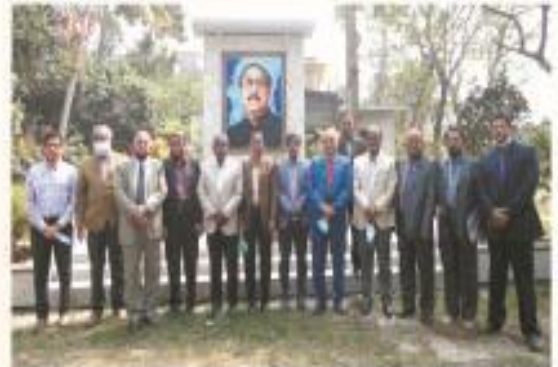
▶ Visit of Dhaka University Inspection Team