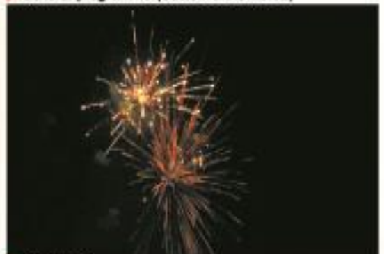
▶ Fire works