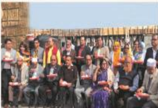
▶ Pitha Uthshob arranged by Orthopedic Dept, 2020