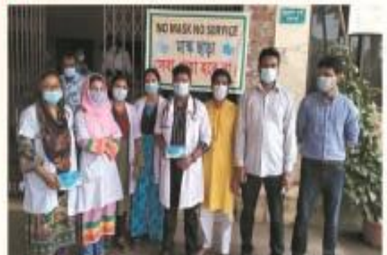
▶ Mask distribution