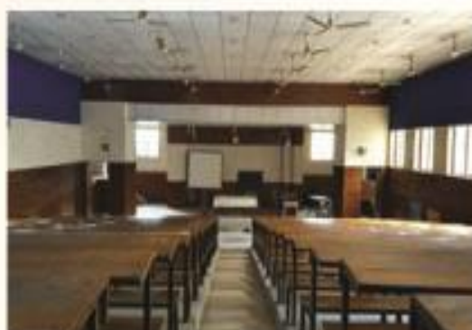
▶ Lecture Hall with modern facilities