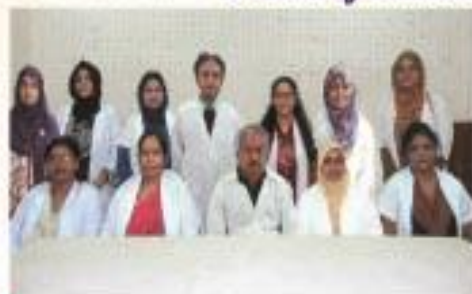
▶ Department of Anatomy