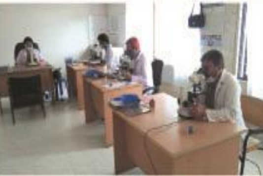
▶ Hospital Pathology