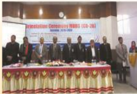
▶ Orientation Ceremony of CB-26