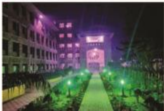
▶ College at night