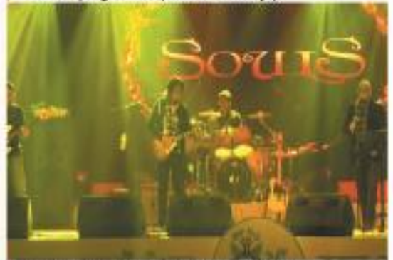
▶ Cultural programme (Souls-Partho Borua)