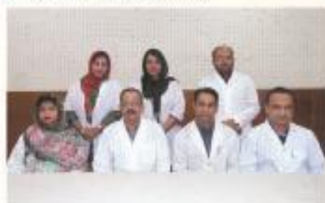
▶ Department of Microbiology