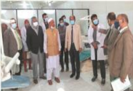
▶ BMDC Visit Dental Unit