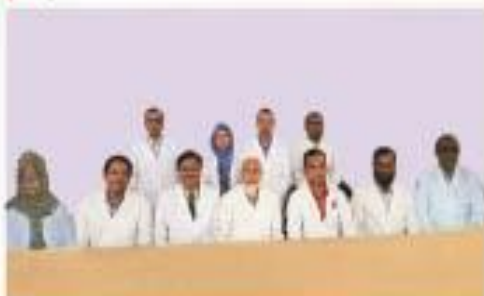
▶ Department of Surgery & Blood Transfusion