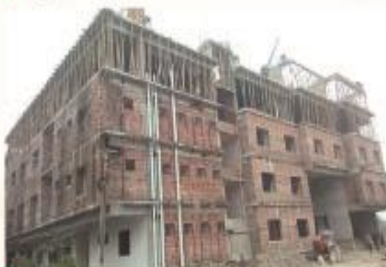
▶ Nursing Institute/Nursing College