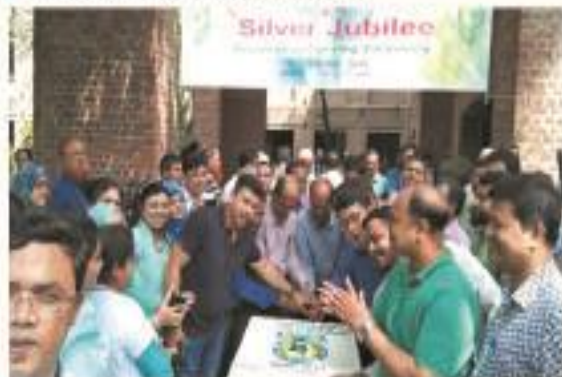
▶ Registration Opening Ceremony