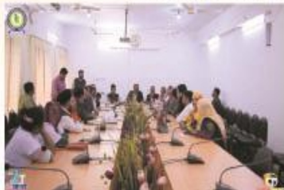
▶ Preparatory meeting of Silver Jubilee