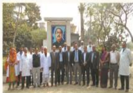
▶ Visit of BMDC, 2020