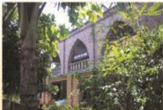
▶ College Mosque