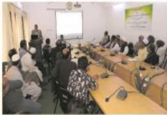
▶ Workshop on Quality Assurance