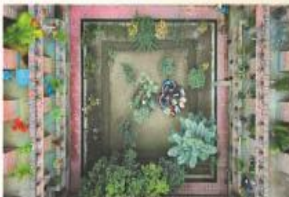
▶ Greenery inside the College