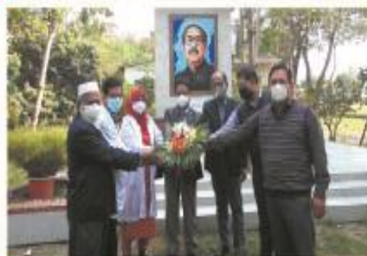
▶ Visit of Director, Health, Mymensingh Division