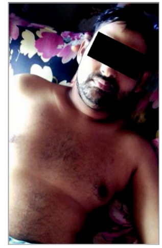
Figure 2 : case 4

segmental increase of messangial cells and matrix. Diffuse interstitial infiltration of lymphocytes, eosinophils and neutrophils was present. There was marked edema in the interstitium. Some renal tubules contain pus casts in the lumen with shedding and necrosis of the tubular epithelium in some renal tubules. No crystal of any form was present in the lumen. Blood vessels were normal. In direct immunoflurescence study no deposit of IgA, IgG, IgM, or C3 was present. Histological diagnosis was acute tubulointerstitial nephritis with mild tubular necrosis.