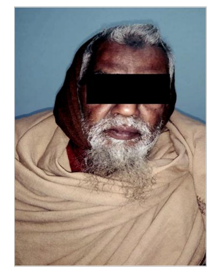
Figure 2: case 1

He required four sessions of hemodialysis and was discharged after two weeks with a falling serum creatinine. Serum creatinine three months later had stabilized at baseline levels.